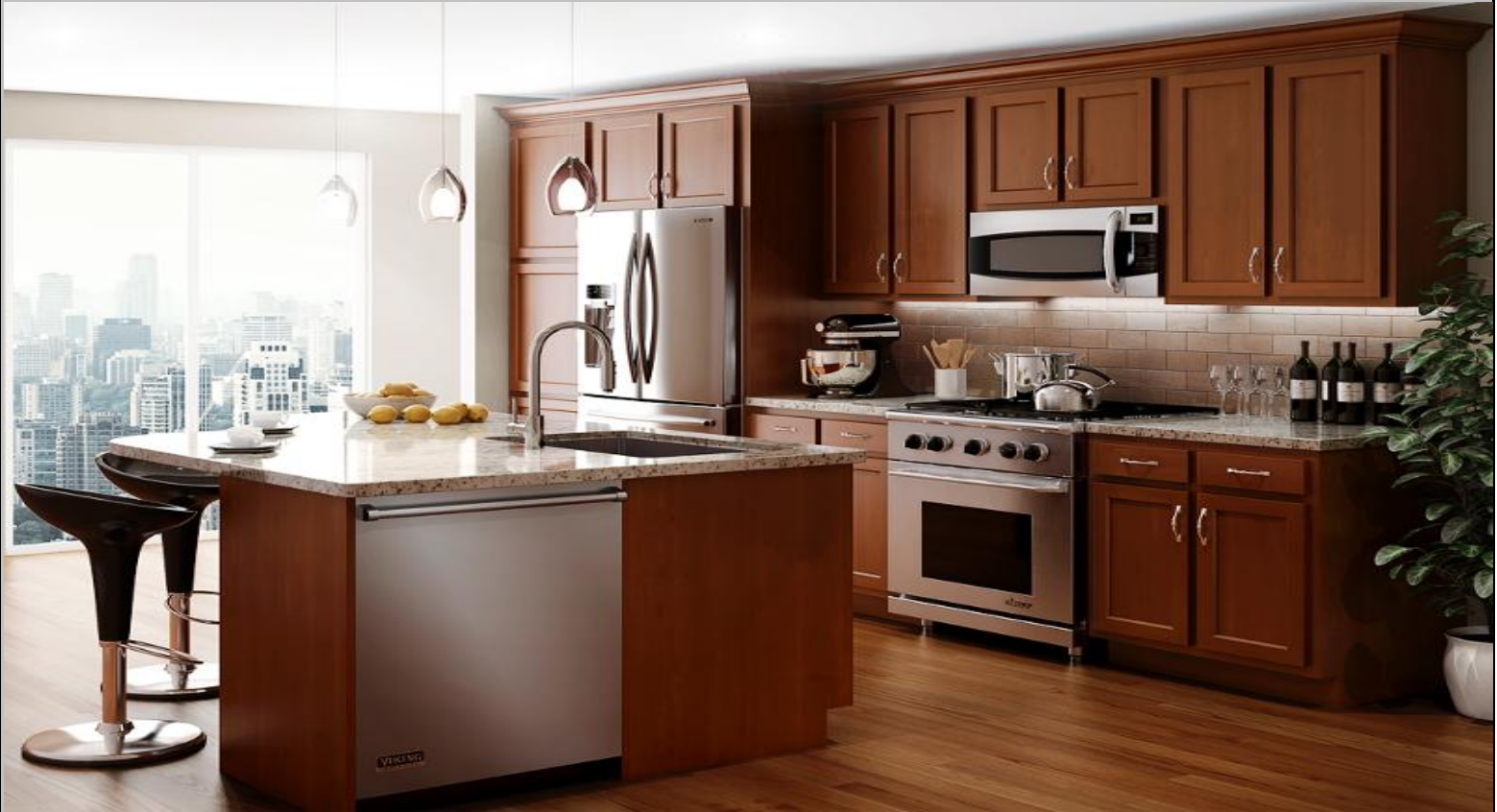
Plywood Drawer Standard