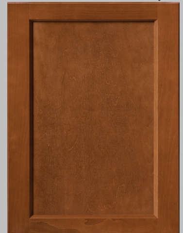
Shaker / Standard Overlay

SIMPLICITY - AFFORDABILITY - AVAILABILITY