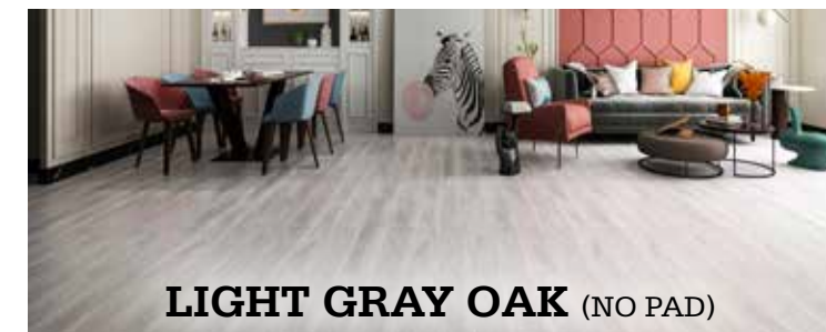
LIGHT GRAY OAK (NO PAD)