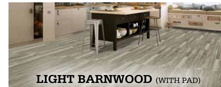
LIGHT BARNWOOD (WITH PAD)