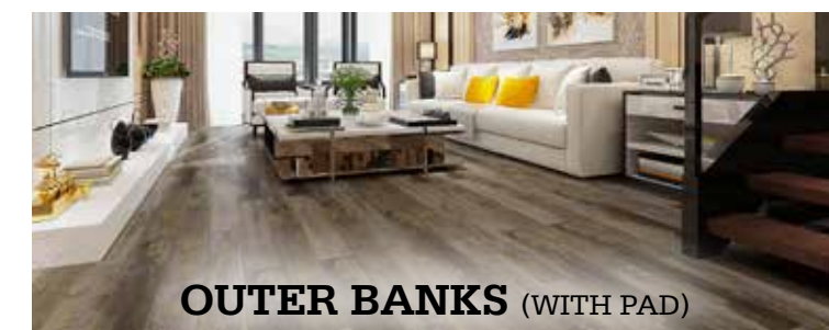
OUTER BANKS (WITH PAD)

Next-generation Stone Polymer Core (SPC) is 100% waterproof and installs easily on most flooring types.