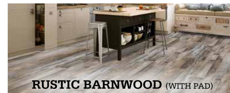
RUSTIC BARNWOOD (WITH PAD)