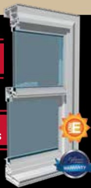
5400 DOUBLE HUNG REPLACEMENT CUSTOM OPTIONS