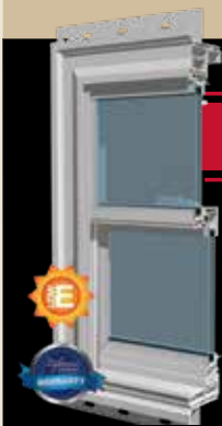
500 DOUBLE HUNG NEW CONSTRUCTION